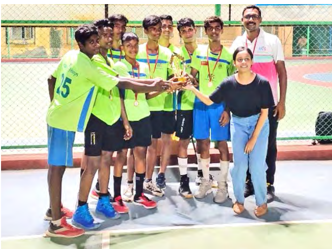
Winners: Pathways - Motilal