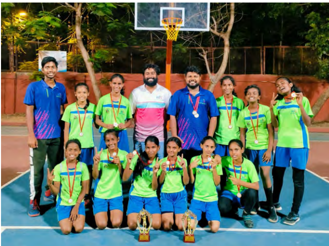
Winners: Vile Parle East MPS