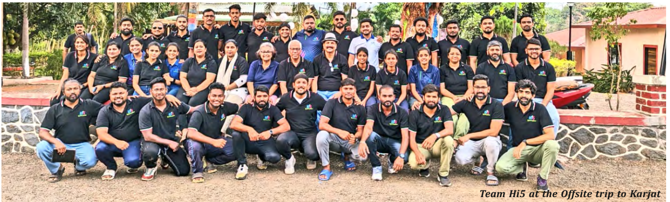
Team Hi5 at the Offsite trip to Karjat

As we celebrate our 8th anniversary, We are filled with gratitude for the remarkable journey of Hi5 Youth Foundation. From a humble vision, we have grown into a thriving organization, impacting the lives of thousands of children across the country. In celebration of this milestone, we gathered for an Offsite meet and greet held in Karjat. Our coaches from Mumbai and Outstation along with the leadership team, came together to reflect on our achievements, share our aspirations, and strengthen our commitment to creating a brighter future for our young champions.