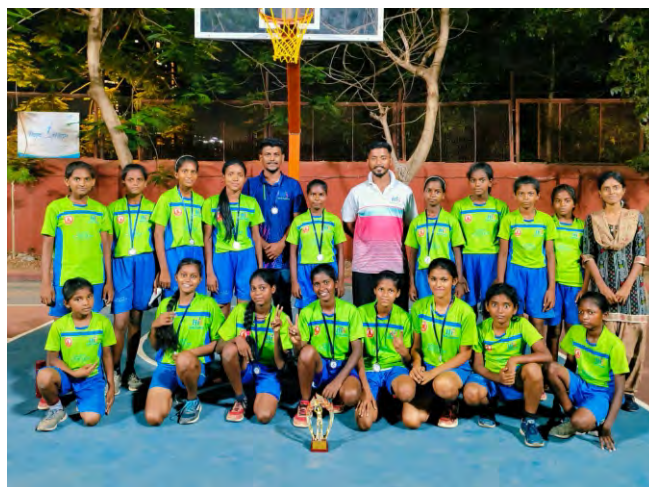
Runner-up: Sant Gadge Maharaj Residential School