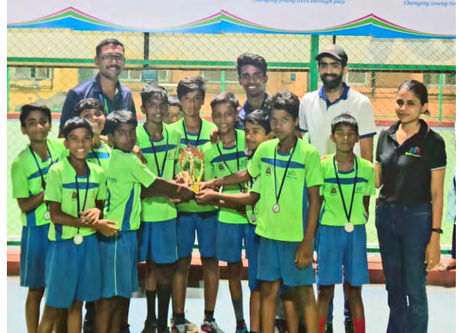
Runner-up: Motilal Nagar BMC School