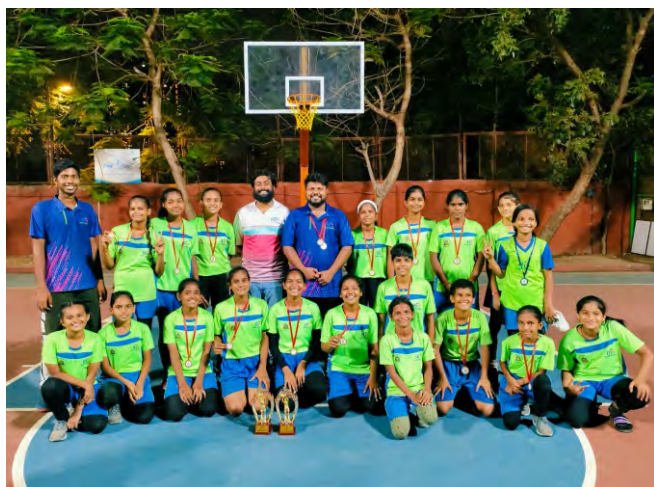
Winners: Vile Parle East MPS