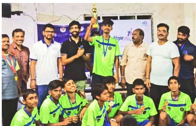
Winners: TTWR Jinnaram