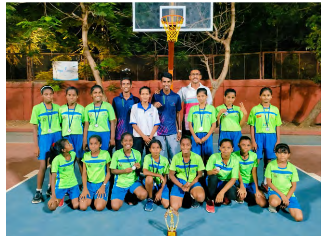
Runner-up: Motilal Nagar BMC School