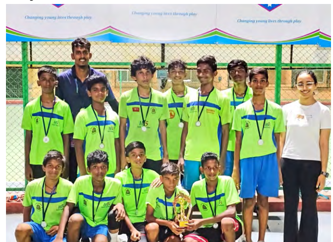
Runner-up: Goshala Marg MPS