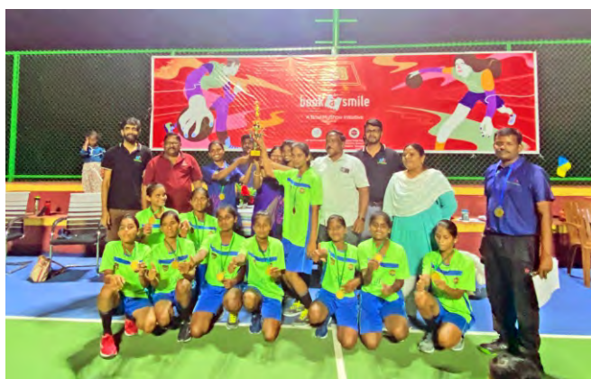
Winners: TTWR Girls Sports School, Chegunta