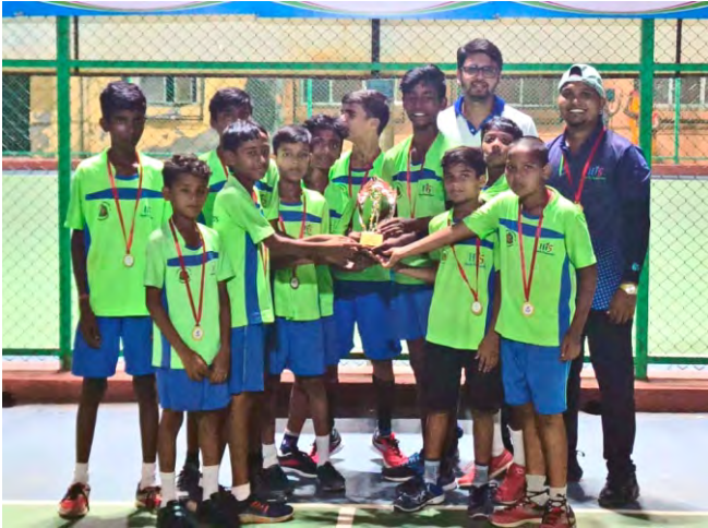
Winners: Unnat Nagar BMC School