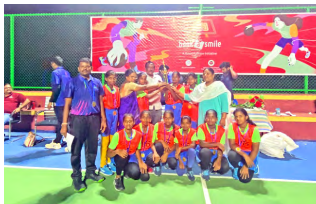
Runner-up: Spoorthi Foundation