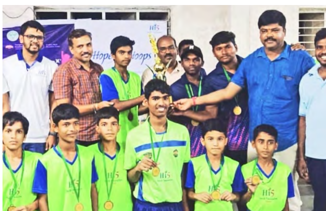
Runner-up: EMRS Balanagar