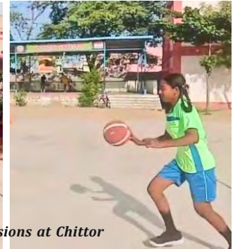
Training sessions at Chittoor