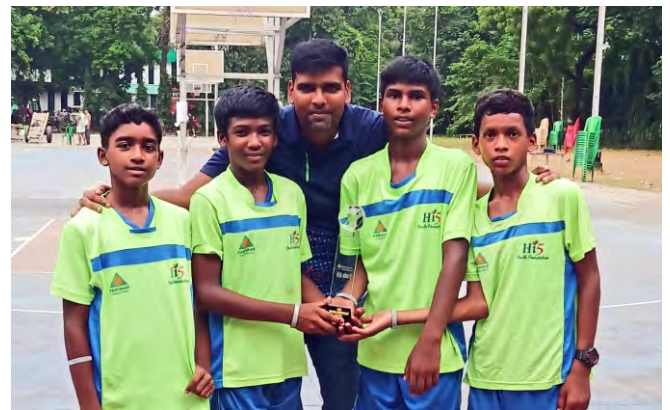
Category : Boys Under 14