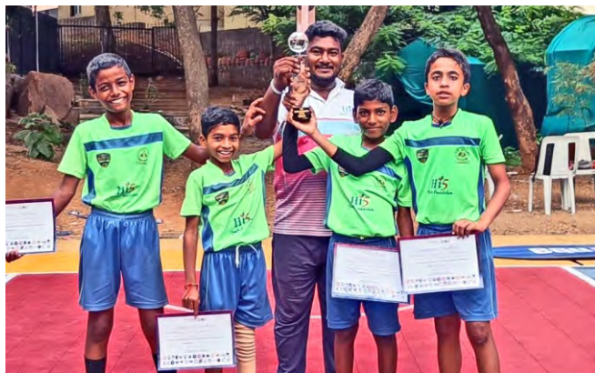
Category : Boys Under 12